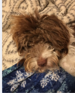
Dan Carnack's Puppy